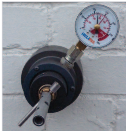
6. Note the reading and then release the tension on the tested wall tie