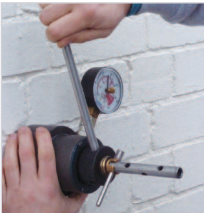
5. Turn the Tommy bar slowly until the proof or maximum load is achieved. DO NOT enter the red zone and DO NOT OVERLOAD