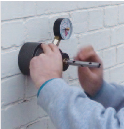
3. Slide the Load Test Unit (LTU) over the LTK and replace the cross pin, engaging it in the castellation on the top of the centre stud