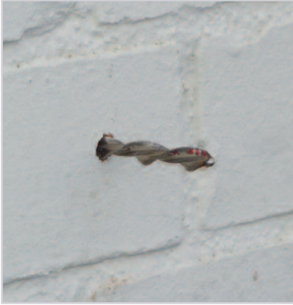
1. Install tie into inner or outer leaf masonry