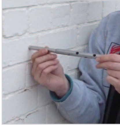
2. Fit the appropriate sized Load Test Key (LTK) at least 50mm (normally one full turn) over the end of the tie. Remove the cross pin, if fitted