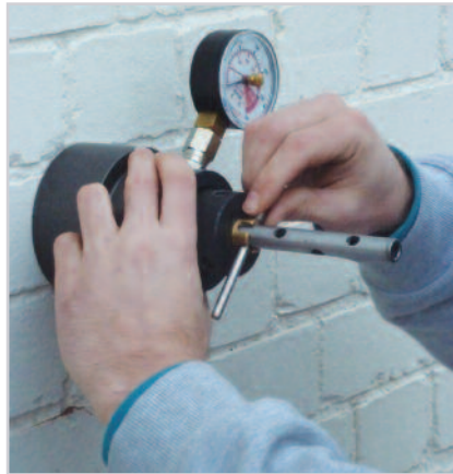
4. Place the cross pin through the LTK and take up the slack on the central nut