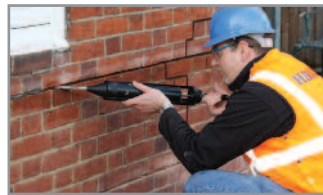
3. Using the Helifix Pointing Gun, inject a bead of HeliBond along the back of the slot