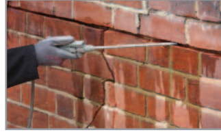
2. Clean out slots and flush with clean water and thoroughly soak the substrate within the slot