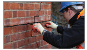
4. Using the HeliBar Insertion Tool push one HeliBar into the grout to obtain good coverage