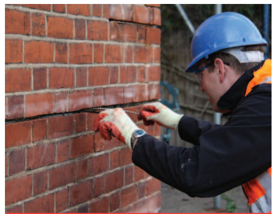
HeliBar is inserted into HeliBond grout within a cut slot