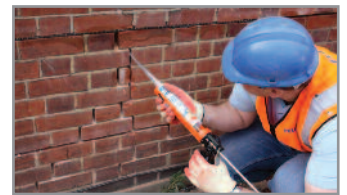
6. Inject CrackBond TE3 into the crack leaving enough space for making it good. Re-point the bed joints with matching mortar and make good the crack.