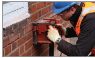
1. Rake out or cut slots into the horizontal mortar beds, a minimum of 500mm either side of the crack