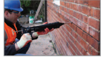
5. Insert a further bead of HeliBond over the exposed HeliBar, finishing 12mm from face and 'iron' firmly into the slot using the HeliBar Insertion Tool